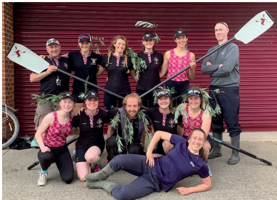
W1 Mays 2019