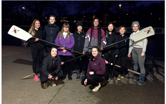
The W3/4 Getting on Race crew after their battle against the elements!