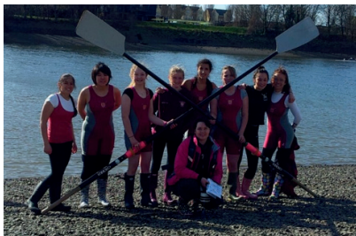
W2 at WeHorr 2012 – we had to race in the novice boat and it was super windy, but we still completed the race only 15s (and 14 places) behind W1