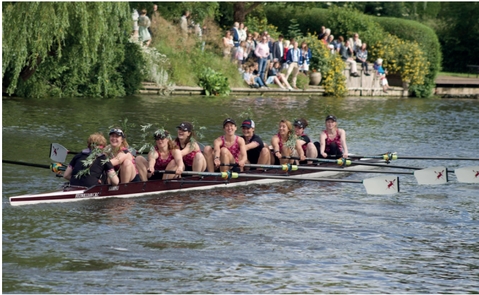
WI with greenery after bumping Girton on the final day of Mays 2019