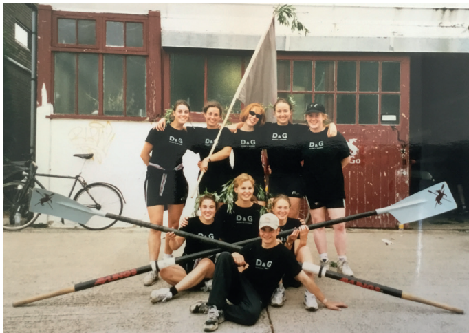
The 1997 blades-winning crew