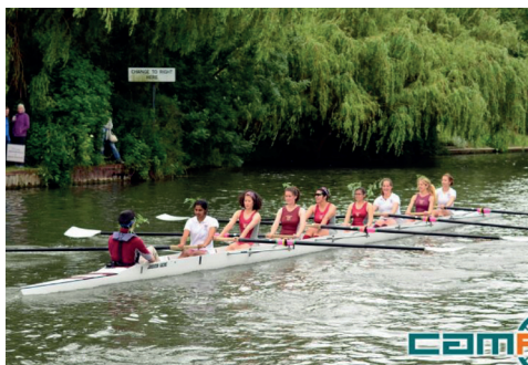
W2 at May Bumps 2013 – went up a division, but denied blades (again) because the crew in front caught a crab

For the better part of the 2010s, FCBC was my constant through the good times and bad times, and I wouldn't change that for the world. #Boatielove