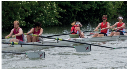
May Bumps 2018 - the M3 beer boat, coxed by Jess (W1 rower) and included Rob (W1 cox) and I, bumping LMBC