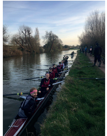
WI with greenery after bumping Girton, Lents 2020