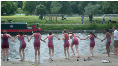
W2 at May Bumps 2012 – so fast that they awarded us a technical bump against Darwin II as they were worried that we'd crash into them with our powerful starts